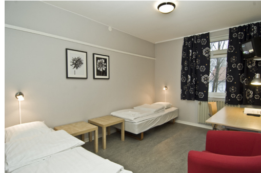
Double room - 620/night