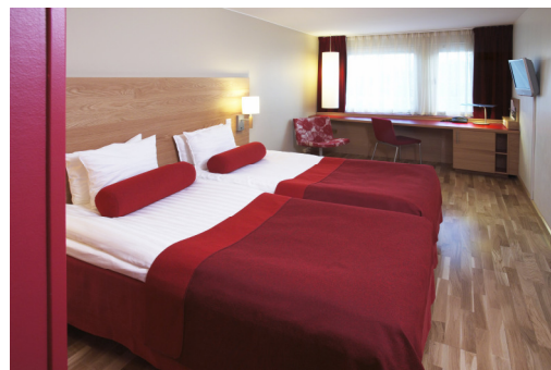
Doubleroom – 1290/night