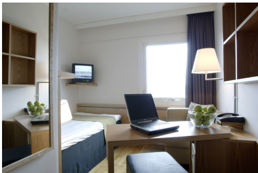
Single room – 815/night