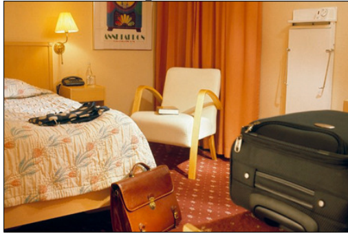
Standard single room – 960/night