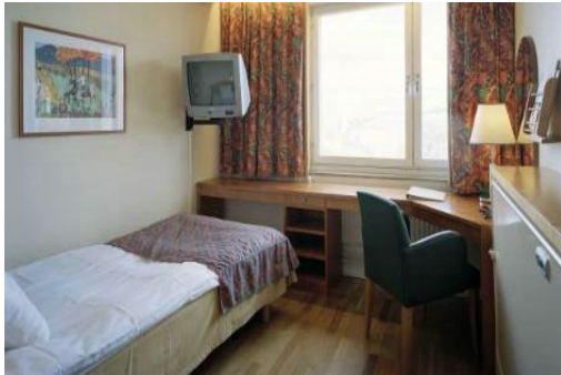
Single room – 980/1080/night