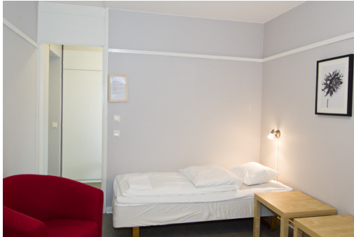
Single room – 620/night