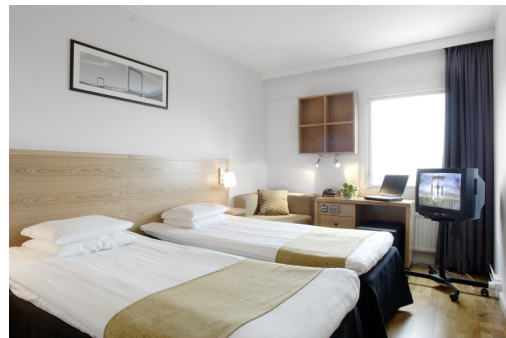
Double room – 1320/night