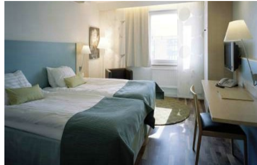
Double room – 1390/night