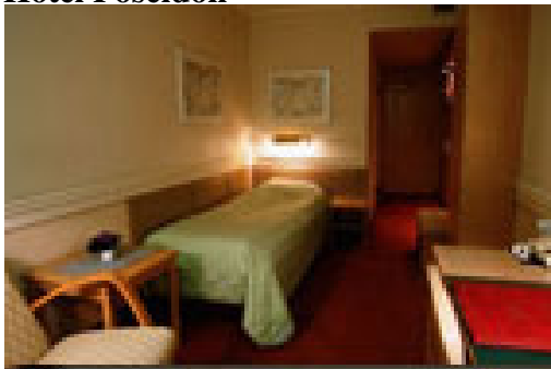
Single room – 920/night