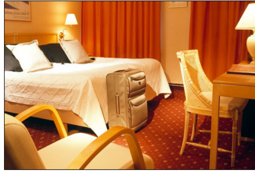
Standard double room – 1310/night