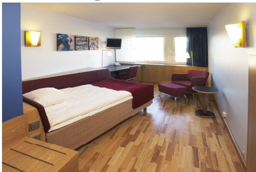
Single room – 980/night